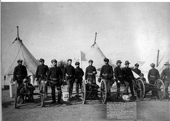
Soldiers of the 7 th Cavalry posing with three of their Hotchkiss guns the day after the Wounded Knee Massacre

Four of these guns were later used at the 1890 Wounded Knee Massacre, where soldiers of the 7 th Cavalry killed hundreds of Lakota men, women and children on a cold winter day of horrific bloodshed. General Nelson Miles was furious at this outcome, and brought court-martial against the officers in charge. But because the massacre was politically popular, he was overridden by President Harrison, and instead Congressional